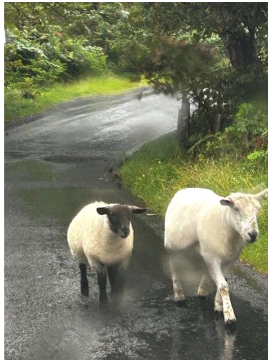
Road traffic in Scotland