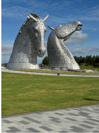
The Mystical Kelpies in Falkirk