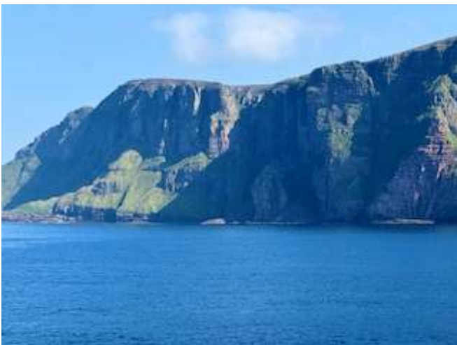
Cliffs in the Orkney Islands