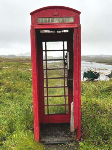
The ubiquitous Red Phone Box