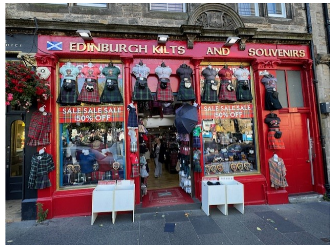
Souvenir shop on the Royal Mile in Edinburgh